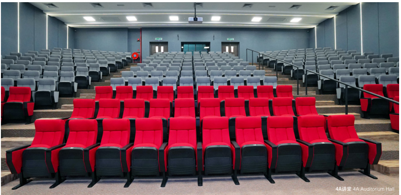
4A讲堂 4A Auditorium Hall