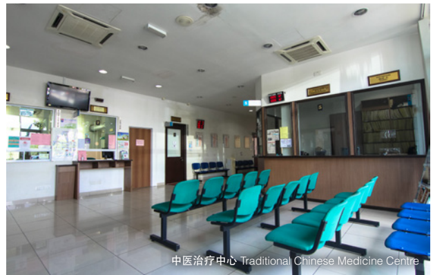
中医治疗中心 Traditional Chinese Medicine Centre