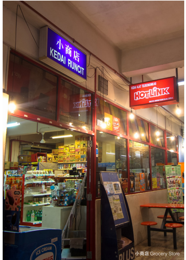
小商店 Grocery Store