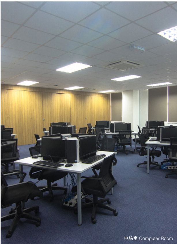
电脑室 Computer Room