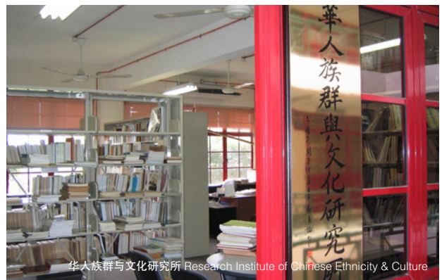
華人群與文化研究所 Research Institute of Chinese Ethnicity & Culture