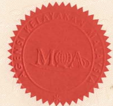
KETUA PEGAWAI EKSEKUTIF