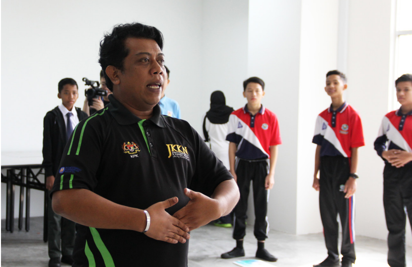
Drama workshop hosted by Department of Malay Studies