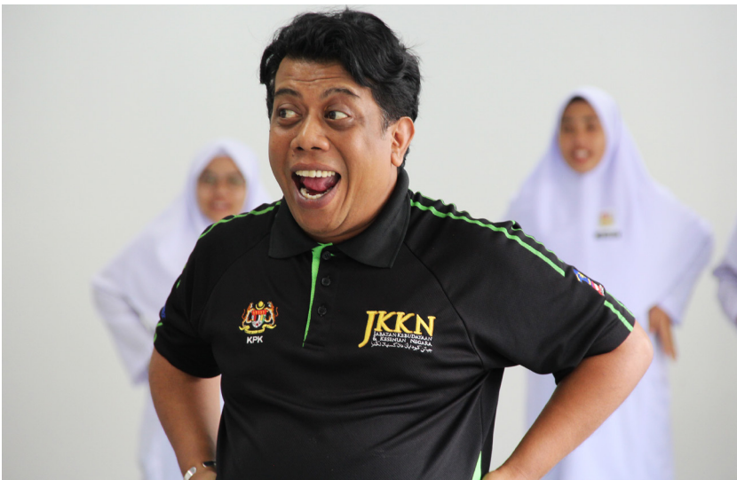
Thankgiving ceremony event organised by Student Society of Chinese Studies