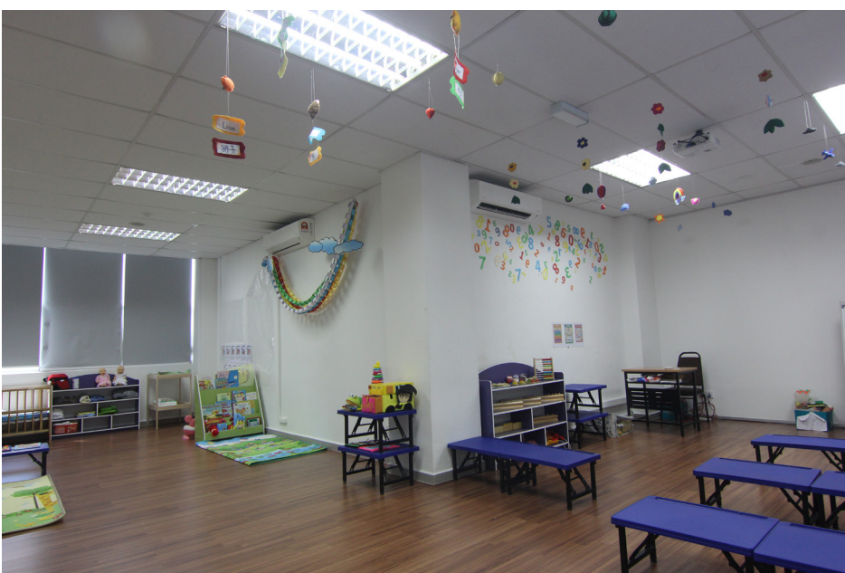
Early Childhood Education Simulation Room (TASKA Setting)