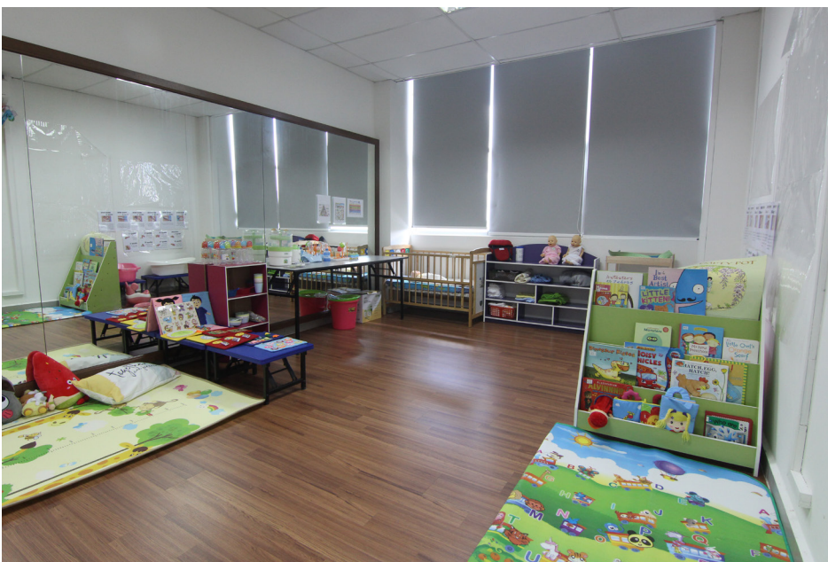
Early Childhood Education Simulation Room (TASKA Setting)