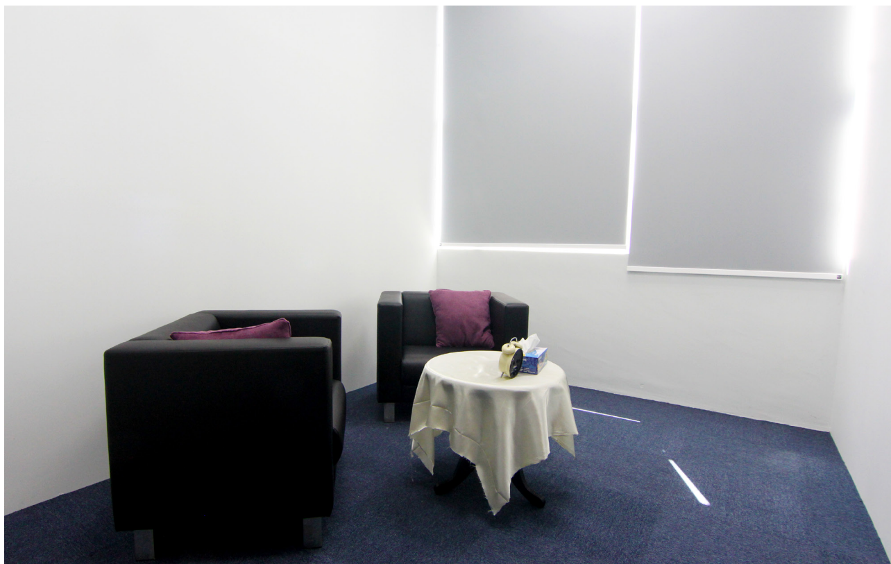
Psychology and Counselling Laboratory