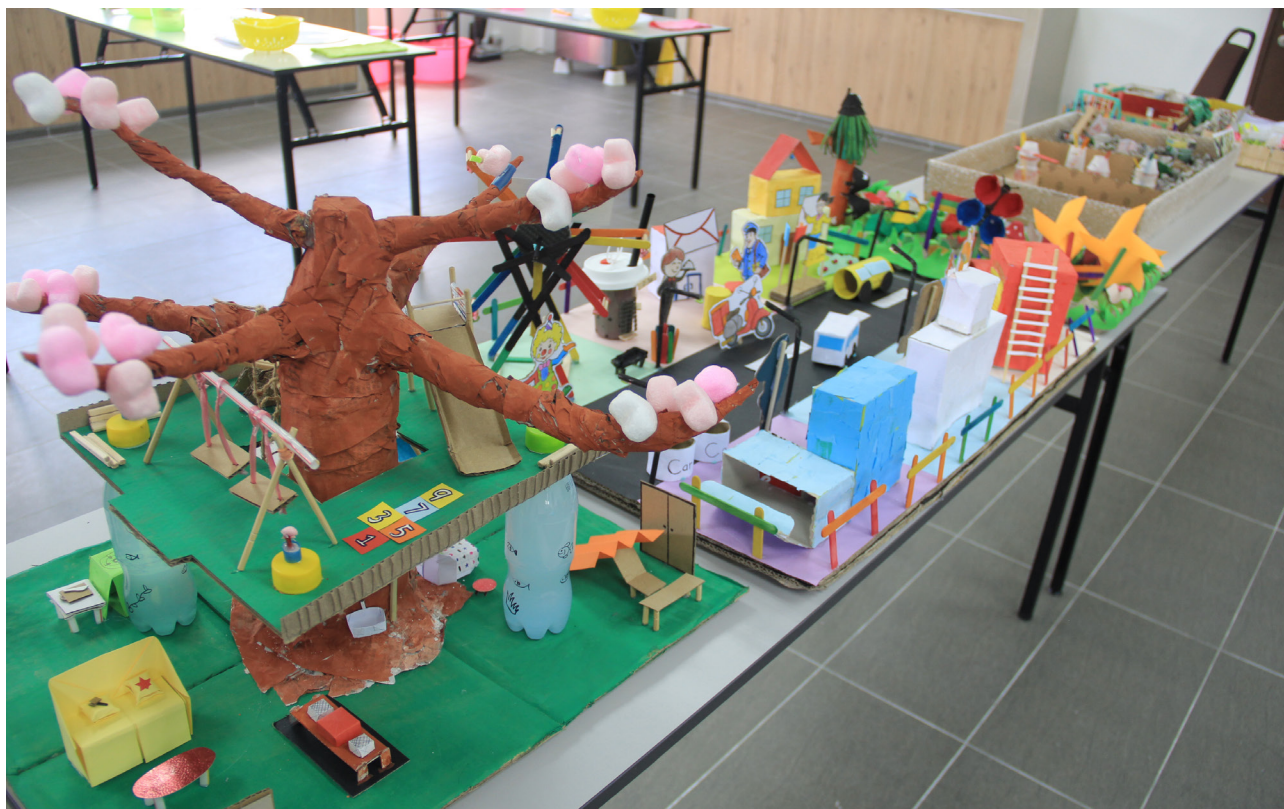
Early Childhood Education students' artwork