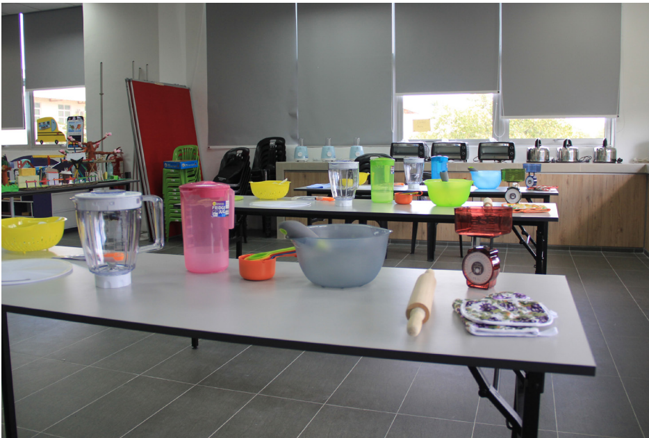
Early Childhood Education Simulation Room (TADIKA Setting)