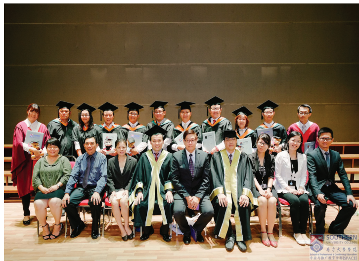
首届EMBA毕业生与讲师合影 Group photo of the first EMBA graduates and lecturers